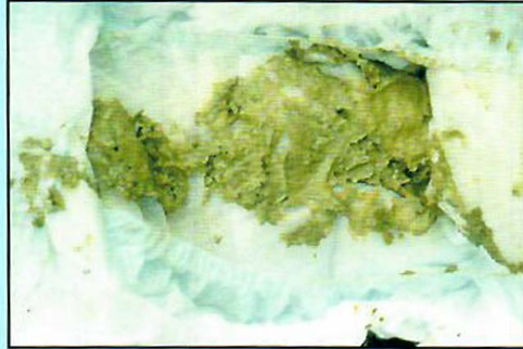
The poop turns green by Day 3 or 4.