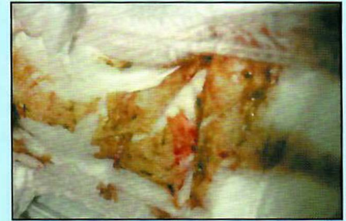
Illness, injury, or allergies can cause blood in poop. Call Doctor.