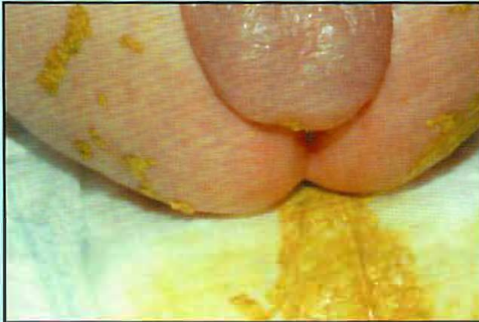
Poop can look seedy.