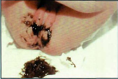
The baby's first poop is black and sticky.

The baby's poop should change color from black to yellow during the first 5 days after birth.