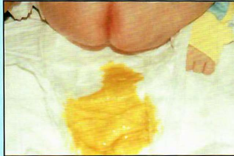
Poop can look watery.